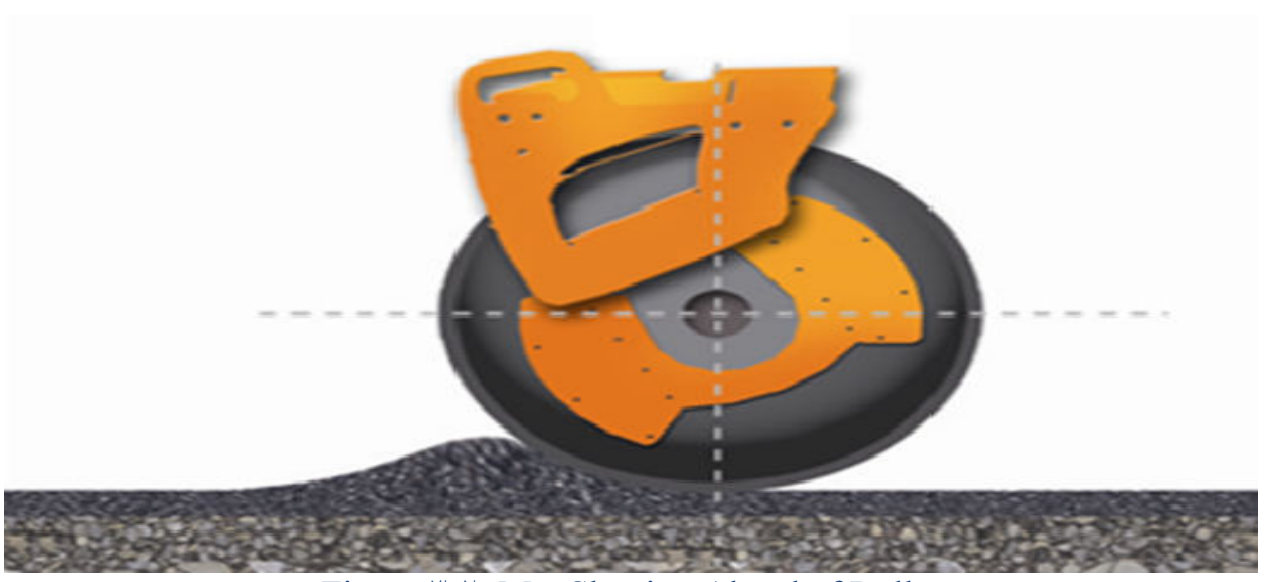
Figure ^{r} - ^{r} . Mat Shoving Ahead of Roller