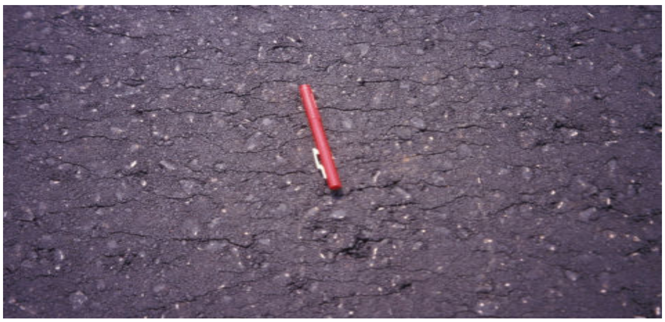
Figure \(\mathbb{\text{-1}}\). Checking Under Roller