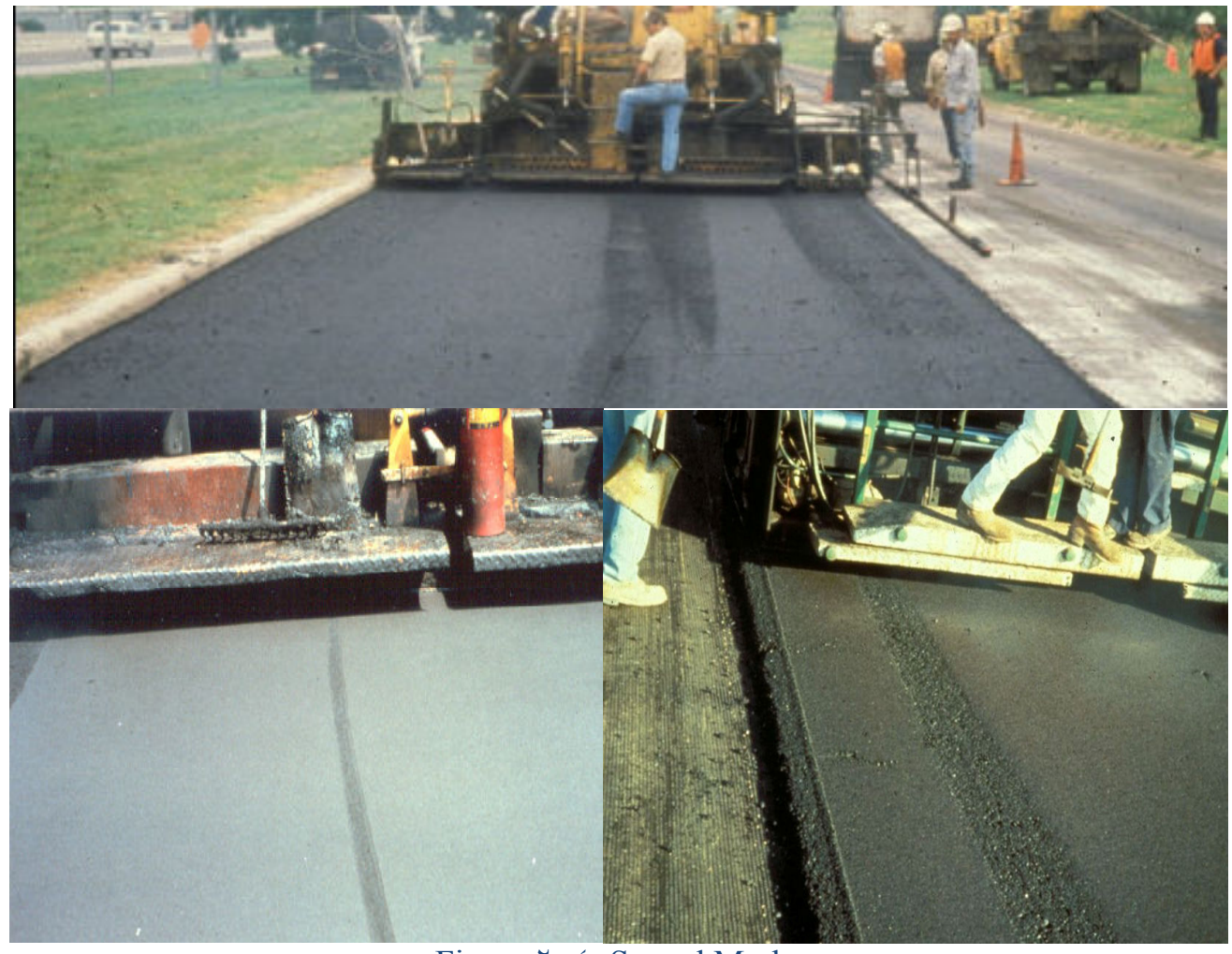
Figure Y- 2. Screed Marks