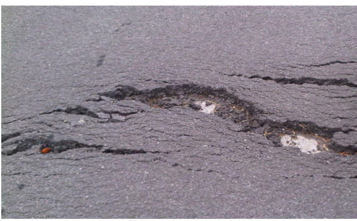
Figure Y-Y. Tearing of Mat – Center