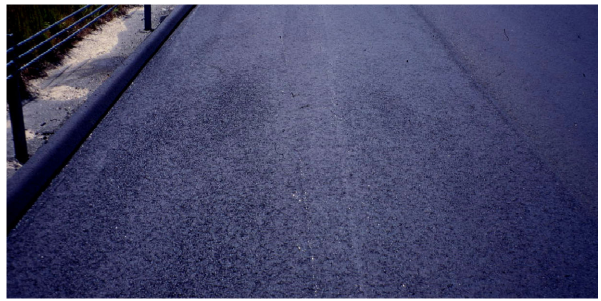
Figure Υ-٤-۱ \. End of Truck Segregation