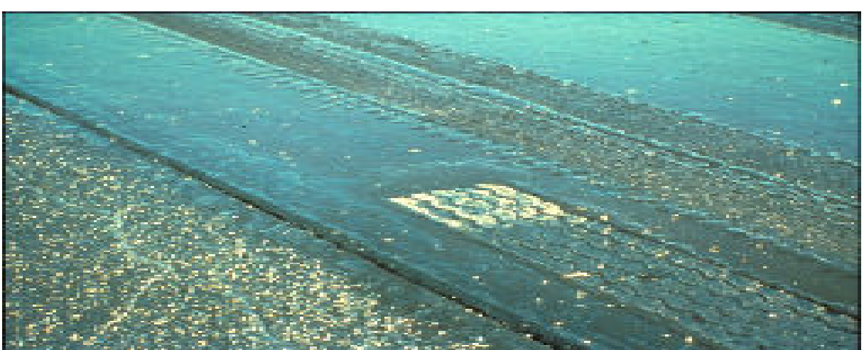
Figure \Upsilon - \Upsilon - \Upsilon - \Upsilon . Incorrect Tack Coats