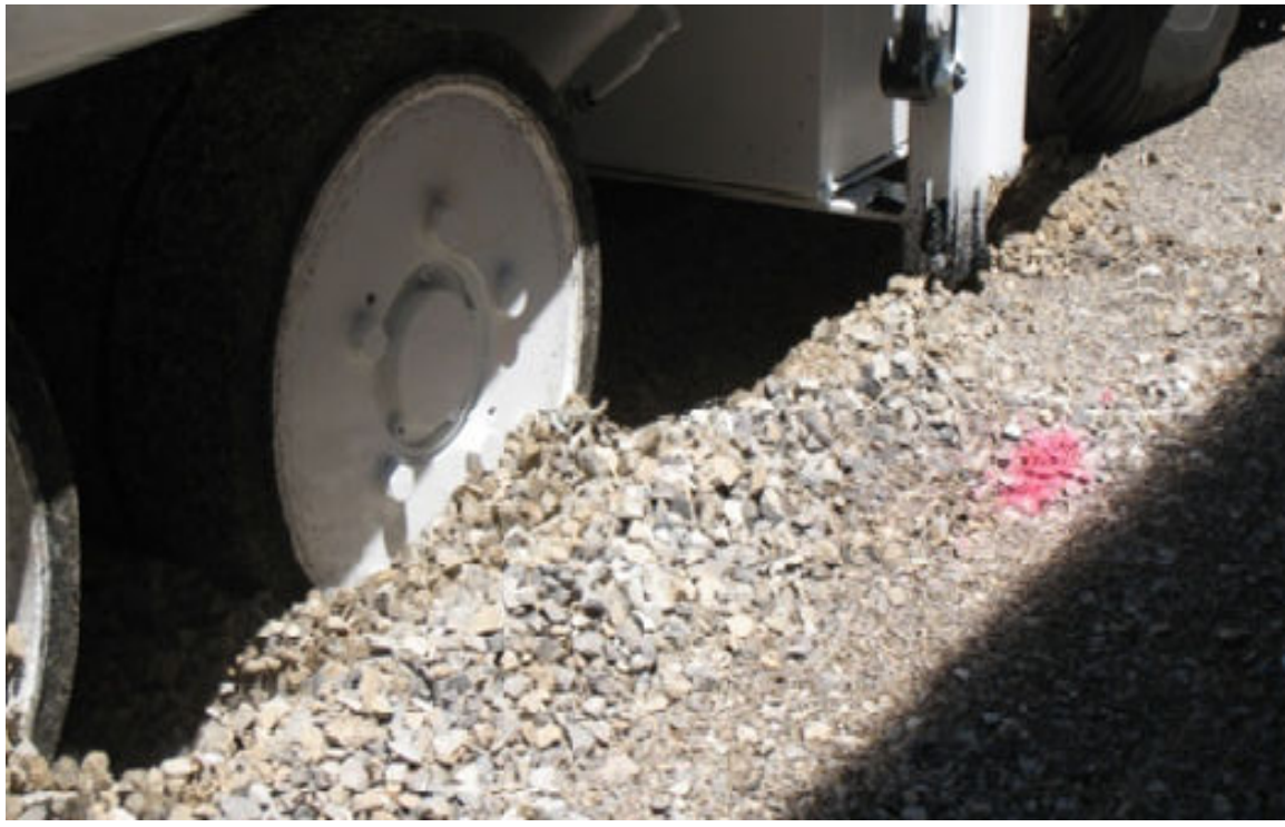
Figure Y-9-11. Yielding Granular Base