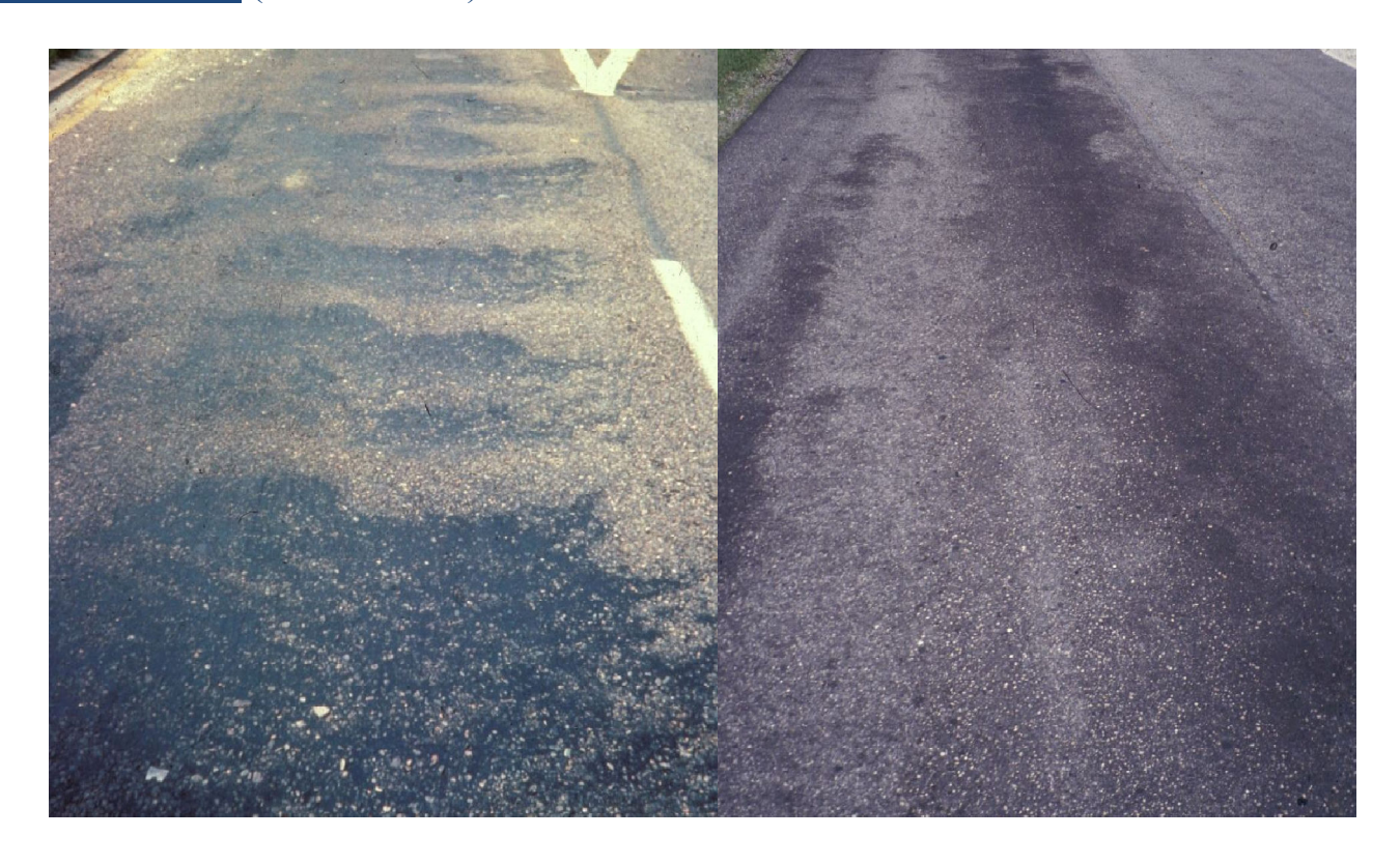
Figure ۲-1. Bleeding