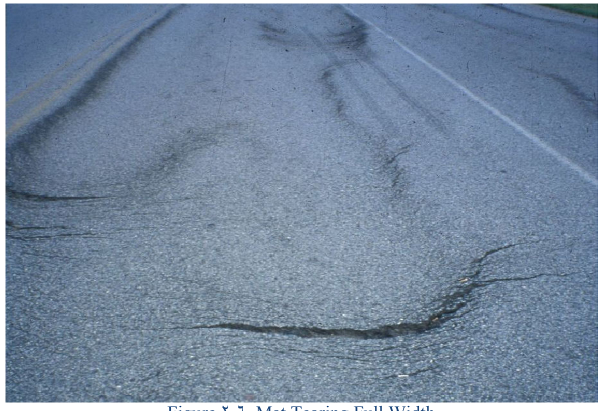
Figure Y-7. Mat Tearing Full Width