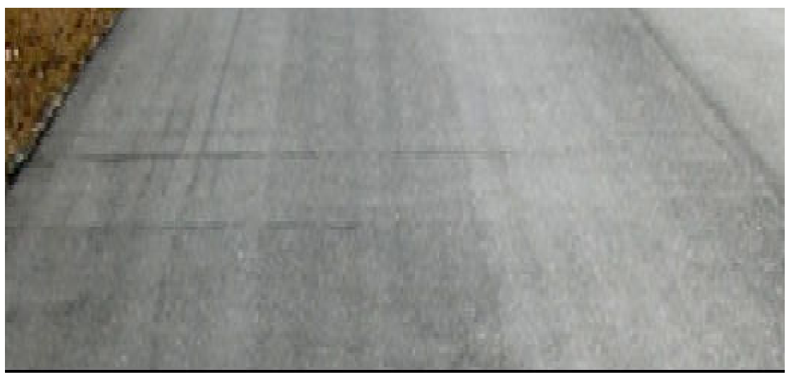
Figure ۲- ٤- ٤. Marks Due to Truck Bumping Paver