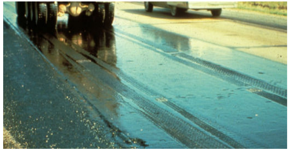
Figure Y-1-1. Tack Too Heavy