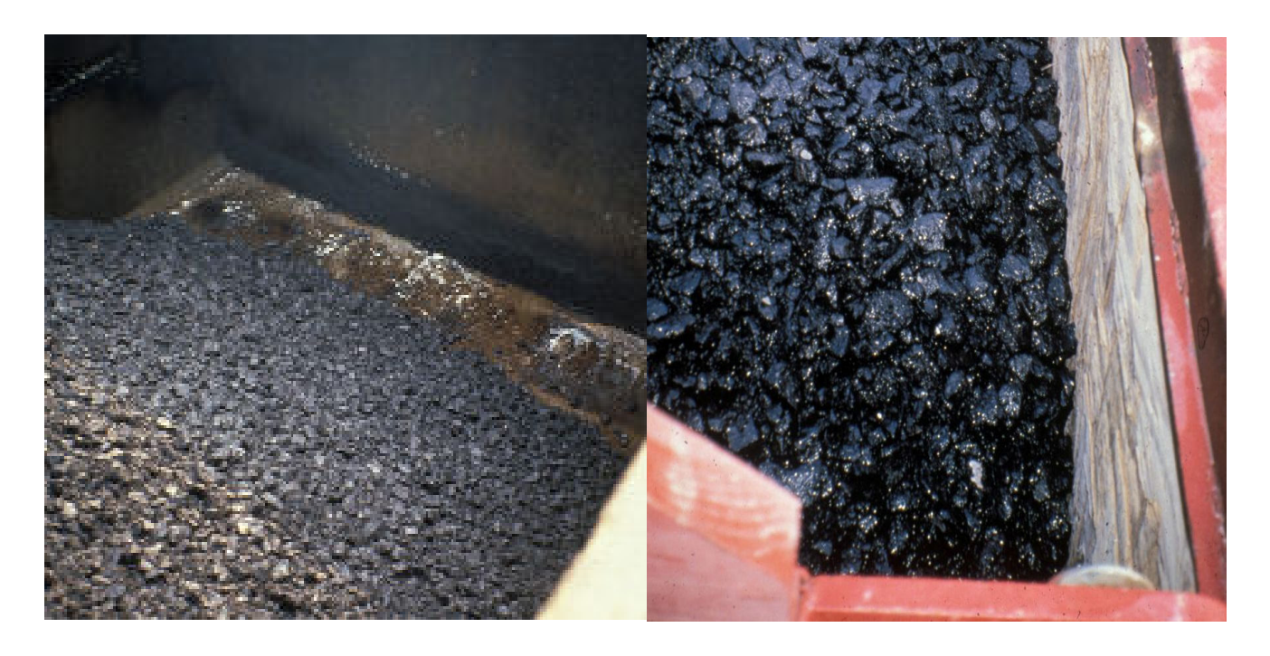
(Figure \- \(\xi\)) End of Truck Segregation