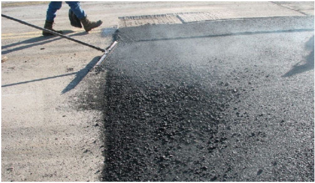
Figure Y-Y-Y. Poor Raking at Joint