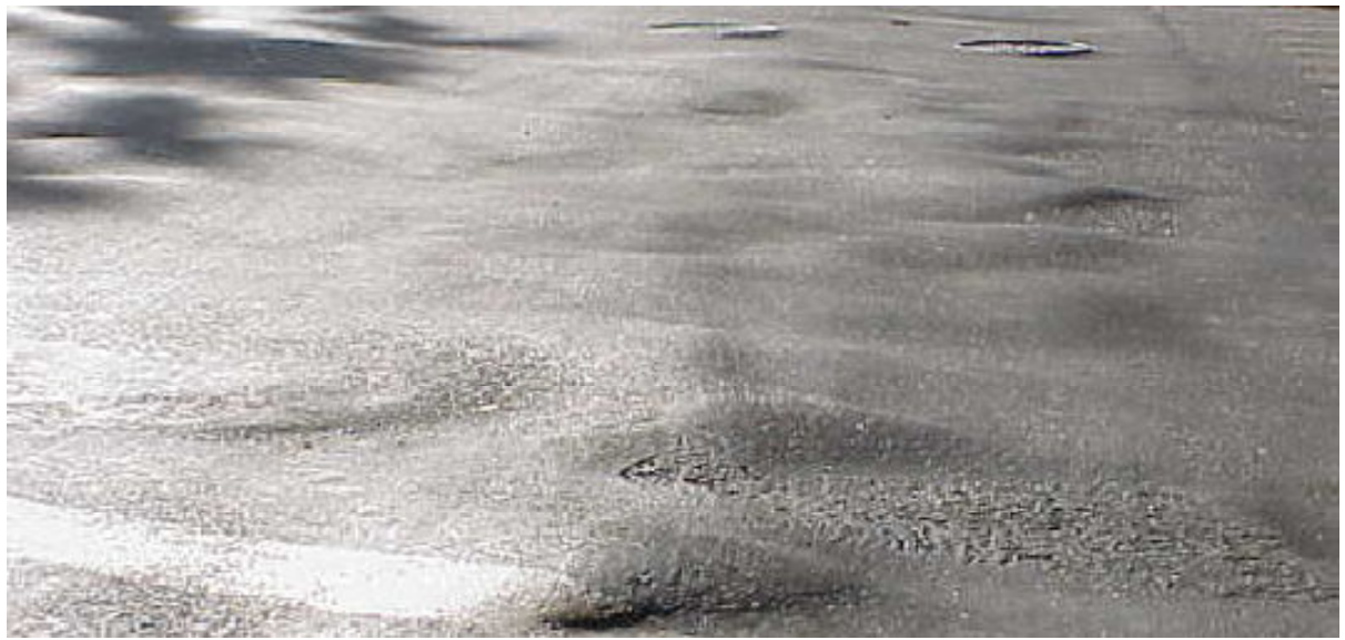
Figure Y-9-1. Unstable HMA