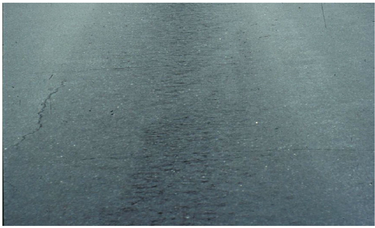
Figure Y-Y-7. Centerline Segregation