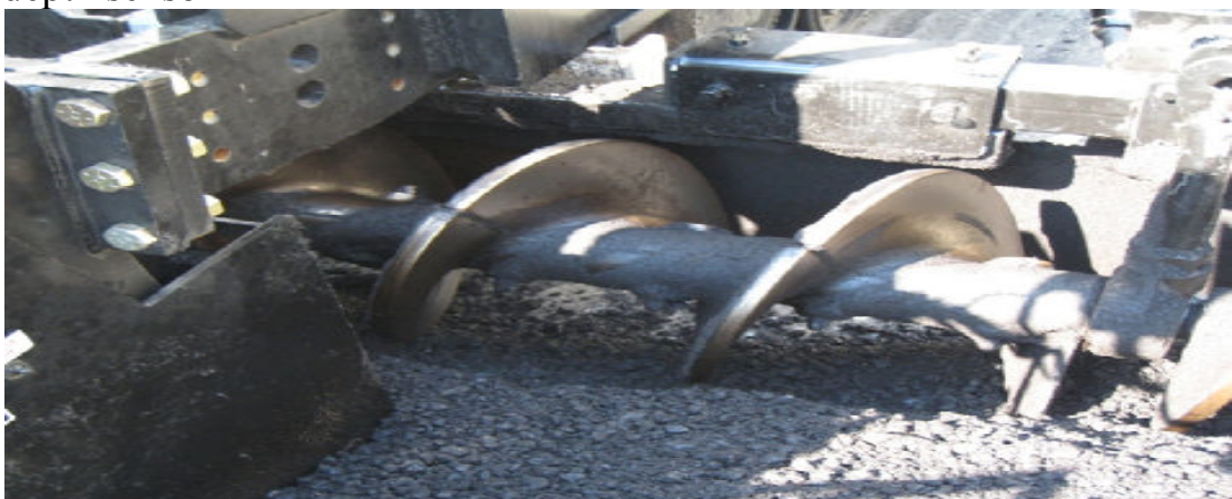
Figure Y-1 ·- o. Auger Material Too Low