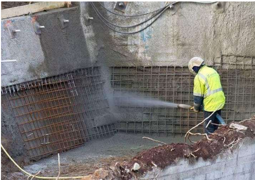
Figure 7: sprayed Concrete new wall