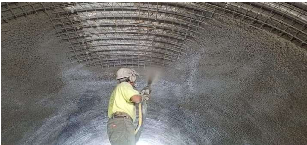
Figure 5: sprayed Concrete in tunnel

Sprayed is used in underground excavations in rocks as well as the advancement of tunnels through altered, cohesion less, and loose soils. As an application, Sprayed is seldom used in isolation, but is used instead in combination with other forms of support and reinforcement such as rock bolting, cable bolts, lattice girders, or steel sets. Sprayed functions as rock reinforcement in two distinct ways. Being applied to the rock at high pressures, it forces its way into the spaces between intact rock pieces. In this way, it effectively prevents falling of individual pieces, constraining the movements within the mass. Secondly, it gains strength rapidly quickly functioning as a membrane.