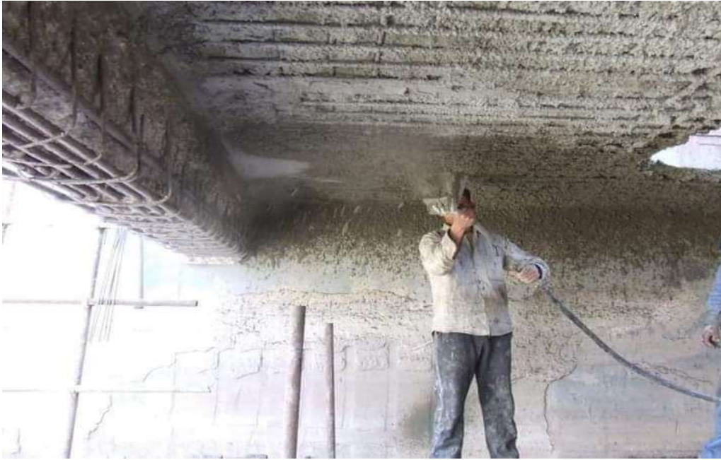
Figure 4: sprayed Concrete restoration