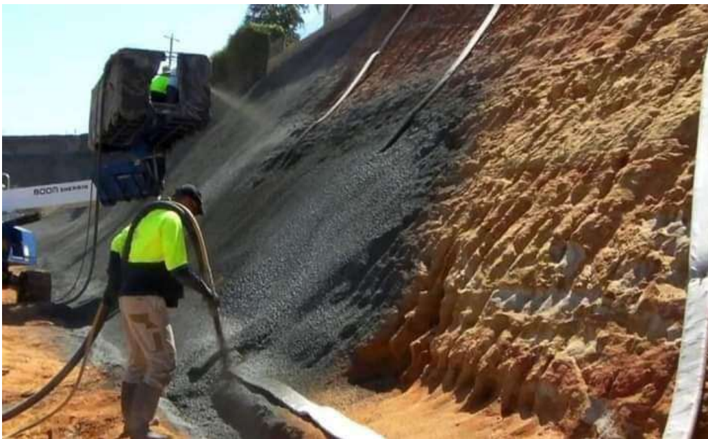
Figure 6: sprayed Concrete for slop

Unstable slopes can be graded out if sufficient space is available and thus the need of supporting the slope by any material like Sprayed can be avoided. However, the situations may arise where space is limited, as is money, and steep slopes are unavoidable. In these situations, Sprayed might be very useful. Sprayed permanently covers slopes or cuts that may erode in time or otherwise deteriorate. Slope protection should be properly drained to prevent damage from excessive uplift pressure. Application of Sprayed to the surface of landfills and other waste areas is beneficial to prevent surface water infiltration. For mass support, the Sprayed may be used with rock bolts and wire mesh, or reinforced with fibers.