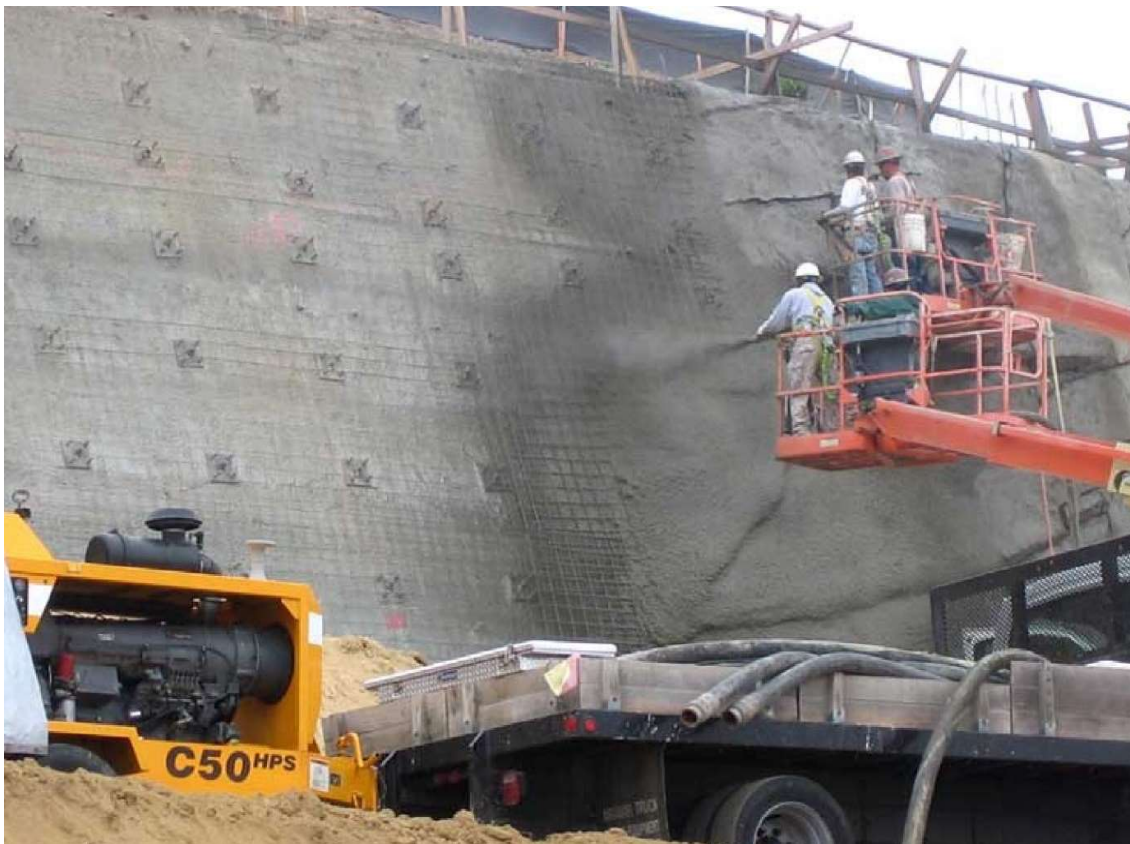
Figure 1: hillside covered by sprayed concrete

Sprayed can be produced by either dry mix or wet mix methods. Although, Sprayed is today a comprehensive term that presents spraying concrete or mortar by both dry and wet mix process. However, in USA the name Sprayed applies only to the one placed by the wet mix method. Whereas, gunite refers to the dry-mix process, in which the dry cementitious mixture is propelled through a hose to the nozzle, and the water is injected immediately prior to application (Engineering Manual, 1993). Apart from gunite and Sprayed, there are also other names for the same material like sprayed concrete, pneumatic concrete, and gun concrete etc.