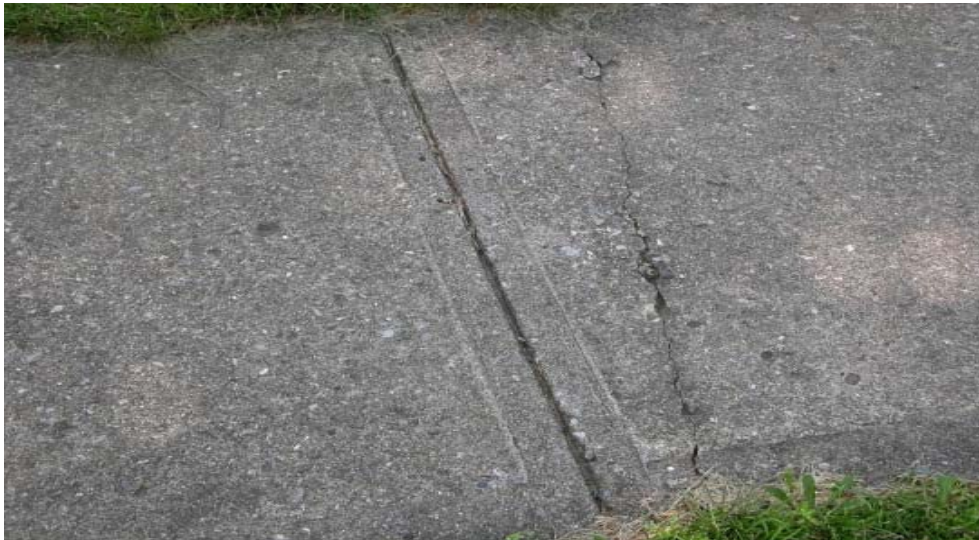
Figure 4 A crack next to a too-shallow joint

or a crack control joint to be effective, it should be \frac{1}{4} as deep as the slab is thick. That is, on a typical four inch thick slab, the joints should be no less than one inch deep; a six inch thick slab would require 1.5 inch deep joints, etc. To minimize the chances of early Random cracking, these joints should be placed as soon as possible after the concrete is poured. If the control joint is not deep enough, the concrete can crack near instead of in it Crack (See Figure 4)