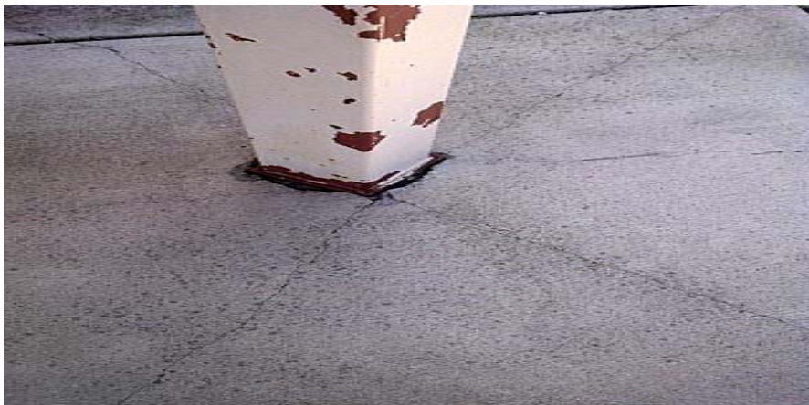
Figure \ Shrinkage cracks originating at re-entrant corner

. However, if an excessive amount of water is added, one can unwittingly reduce the concrete's strength. Plastic shrinkage cracks can happen anywhere in a slab or Wall, but one place where they almost always happen is at re-entrant corners. Re-entrant corners are corners that point into a slab. For example, if one were to pour concrete around a square column, he would create four reentrant corners. Because the concrete cannot shrink around a corner, the stress will cause the concrete to crack from the Point of that corner (See Figure \).