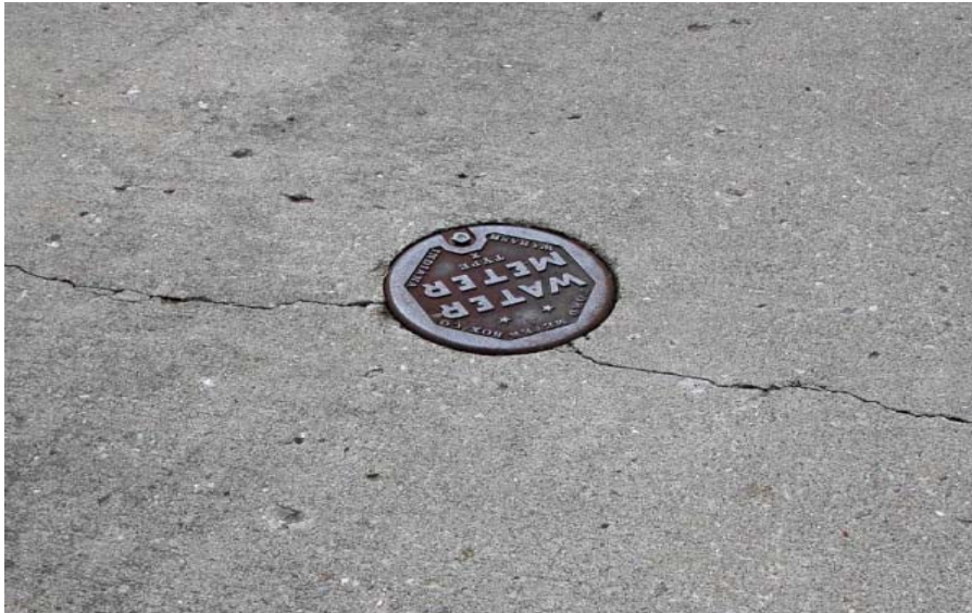
Figure ۲ Shrinkage crack at slab penetration

A rounded object in the middle of a slab creates the same problem as a re-entrant corner. This is commonly evidenced around slab penetrations such as pipes, plumbing fixtures, drains, and manhole castings. The concrete cannot shrink smaller than the object it is poured around, and this causes enough stress to crack the concrete. (See Figure ۲).