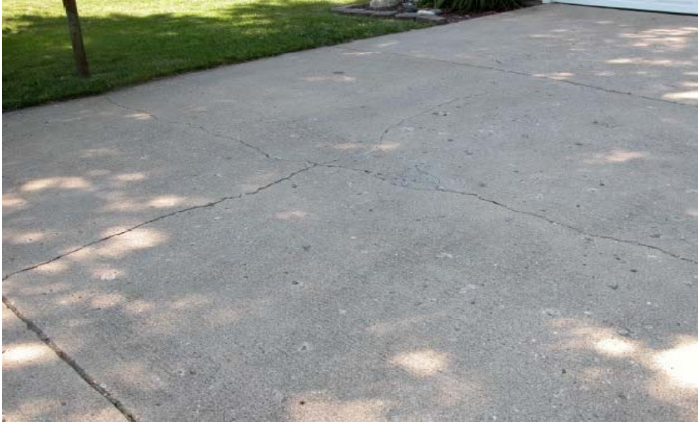
Figure 9 Driveway cracks where joints should have been placed

Another reason that concrete cracks is expansion. In very hot weather a concrete slab, like anything else, will expand as it gets hotter. This can cause great stress on a slab. As the concrete expands, it pushes against any object in its path, such as a brick wall or an adjacent slab of concrete. If neither has the ability to flex, the resulting force will cause something to crack. An expansion joint is a point of separation, or isolation joint, between two static surfaces. Its entire depth is filled with some type of compressible material such as tar-impregnated cellulose fiber, closed-cell poly foam, or even lumber (See Figure 10). Whatever the (compressible material, it acts as a shock absorber which can “give” as it is compressed. This relieves stress on the concrete and can prevent cracking.