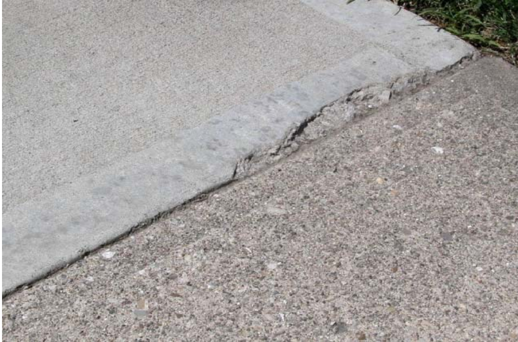
Figure 4 Expansion joint between these slabs would have prevented chipping

Expansion joint material can also prevent the slab from grinding against the abutting rigid object during periods of vertical movement. During these times of heaving or settling, expansion joint material prevents the top surface of the slab from binding up against the adjacent surface and flaking off (See Figure 4).