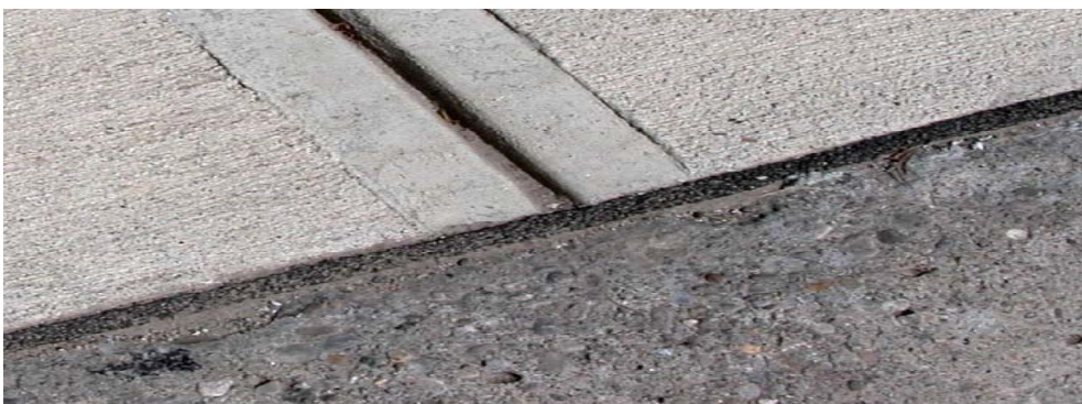
Figure 10 Foam expansion joint separating driveway and

Another reason that concrete cracks is expansion. In very hot weather a concrete slab, like anything else, will expand as it gets hotter. This can cause great stress on a slab. As the concrete expands, it pushes against any object in its path, such as a brick wall or an adjacent slab of concrete. If neither has the ability to flex, the resulting force will cause something to crack. An expansion joint is a point of separation, or isolation joint, between two static surfaces. Its entire depth is filled with some type of compressible material such as tar-impregnated cellulose fiber, closed-cell poly foam, or even lumber (See Figure 10). Whatever the (compressible material, it acts as a shock absorber which can “give” as it is compressed. This relieves stress on the concrete and can prevent cracking.