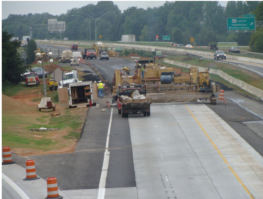
unbonded concrete “white topping” overlay