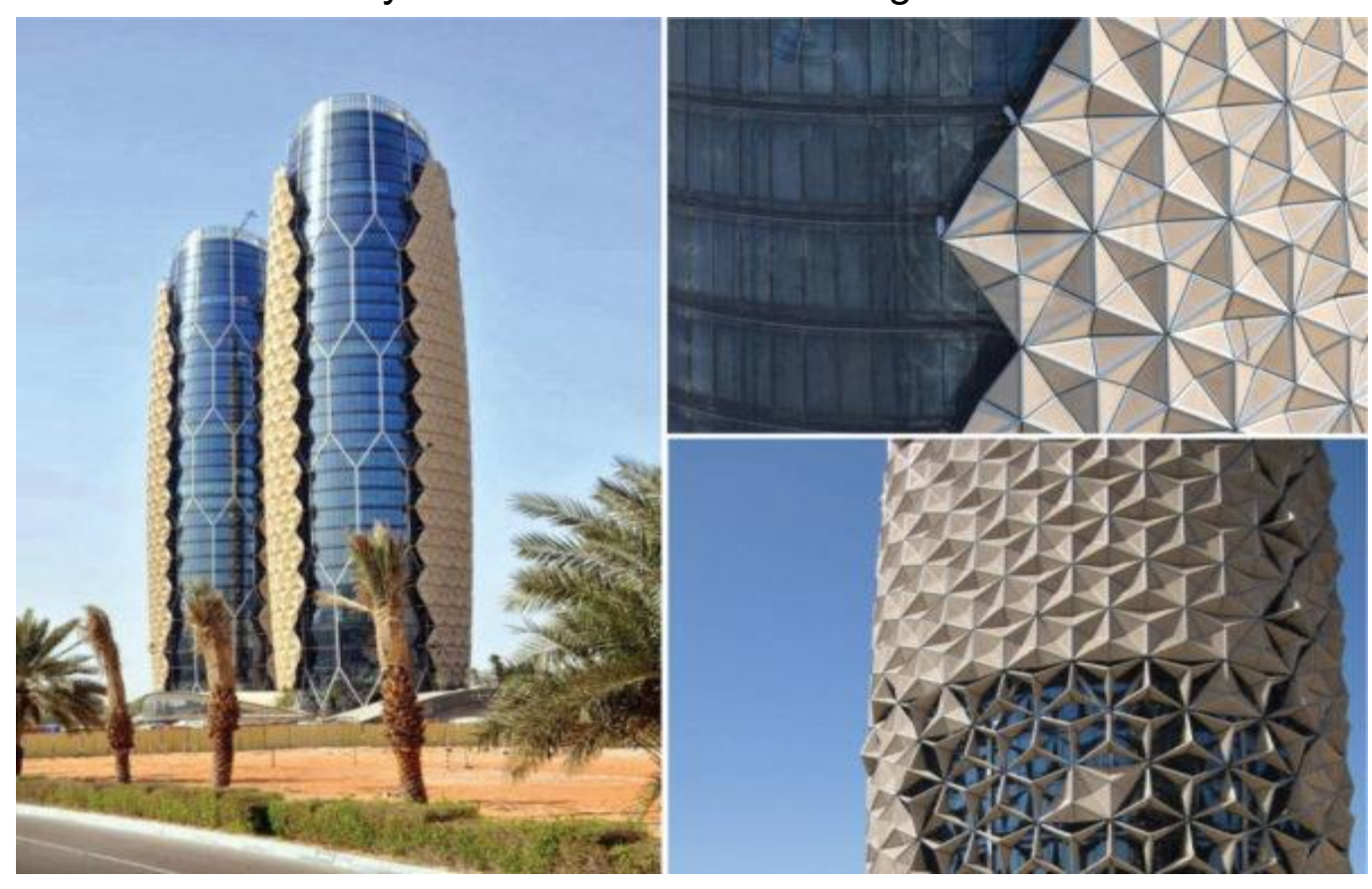
Al Bahar Towers Responsive Facade | Aedas

Mashrabiyas. On <u>Arup's Website</u> they state that, 'the system is predicted to reduce the solar energy entering the building by 20% and is one of a number of innovative measures to improve environmental performance and limit energy use.' They also claim that the design has resulted in 40% saving in carbon emissions. This restores our faith in the use of dynamic facades in our designs.