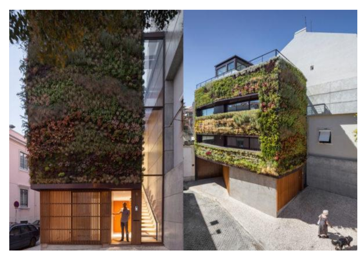
House in Travessa Do Patrocinio in Lisbon | Luis Rebelo de Andrade

story height facade with vegetation, creating a vertical garden, filled with around 4500 plants from 25 different Iberian and Mediterranean varieties which occupies 100 square meters. "Therefore, this project is in fact a mini lung and an example of sustainability for the city of Lisbon, keeping the principles of a living typical habitat and a relationship with the outside, assuming a revitalizing urban role."