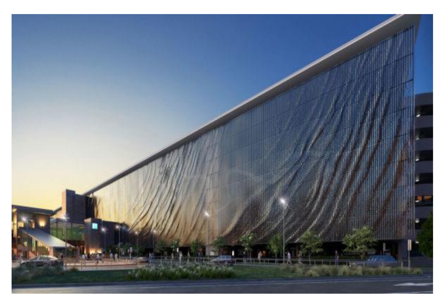
Brisbane Domestic Terminal Carpark in Australia | UAP

facade. "Viewed from the exterior, the car park's entire eastern side will appear to ripple fluidly as the wind activates 250,000 suspended aluminium panels. As it responds to the ever-changing patterns of the wind, the Facade will create a direct interface between the built and natural environments," said UAP Workshop (2011). The facade itself constantly stays in moving motion as the wind blows.